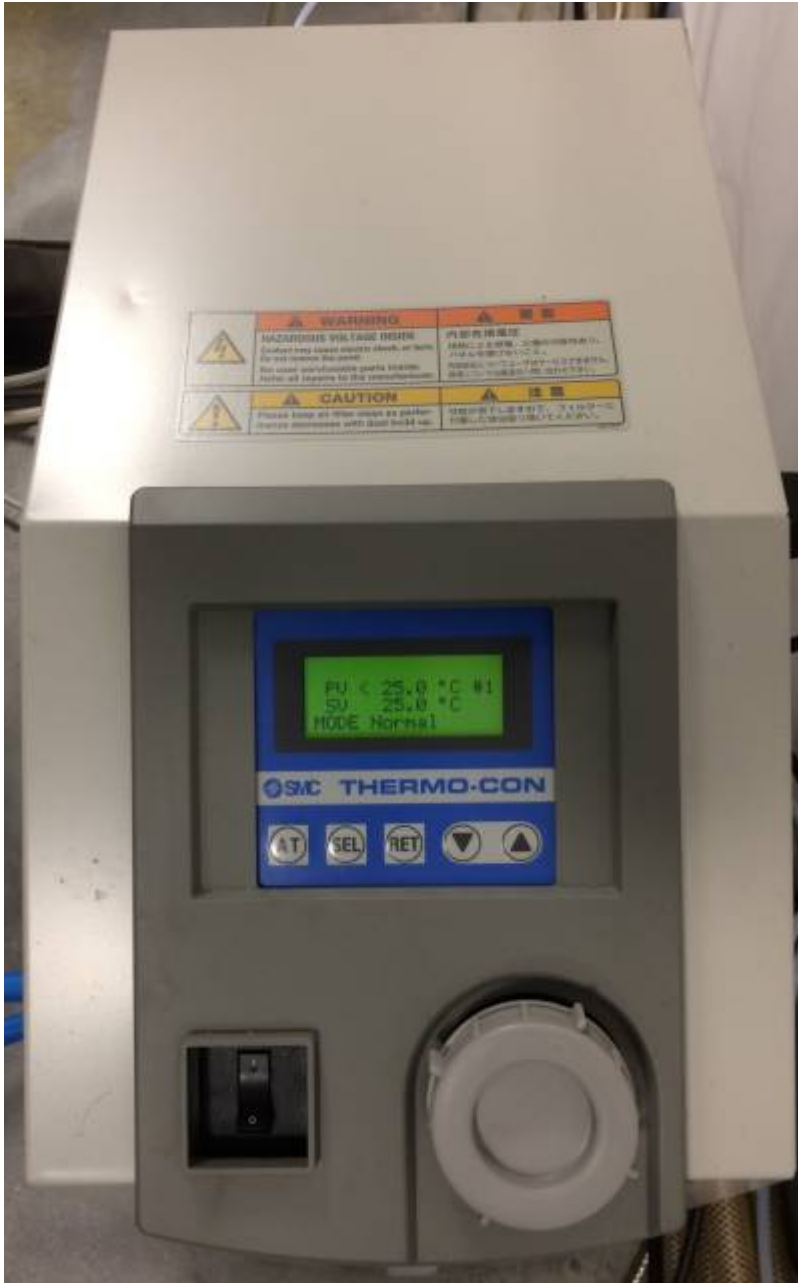
Switch ON the power supply for the EIGER.