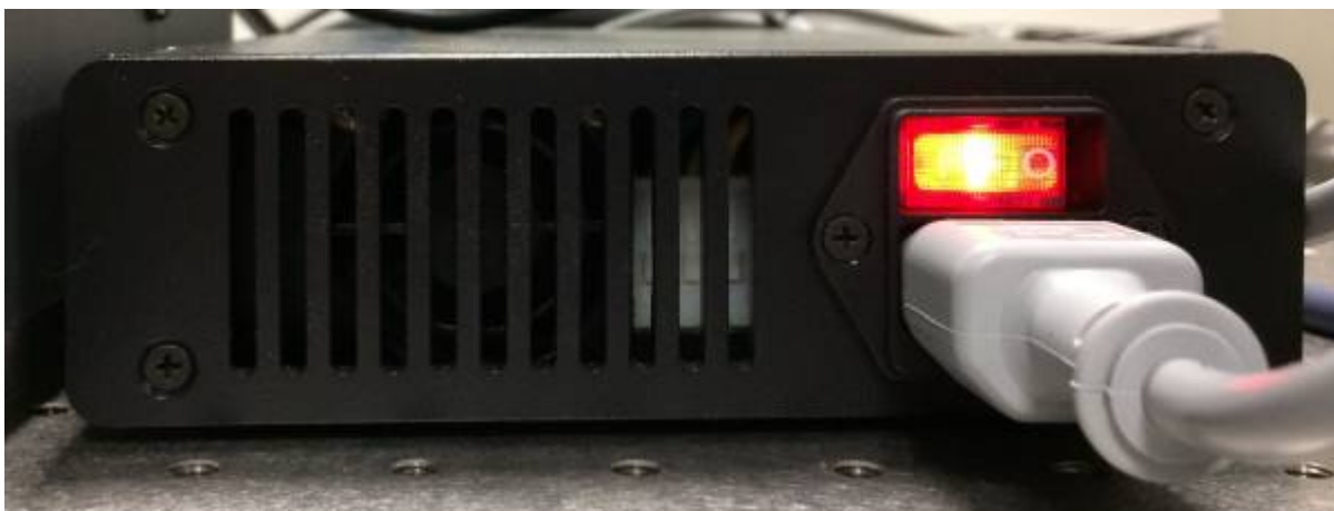
Switch ON the framegrabber.